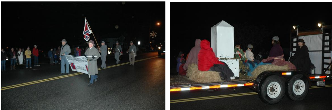
Figure 7: The Foundation was represented by members of the Charlotte County Greys Camp 1964 Sons of Confederate Veterans and the H. A. Carrington Chapter of the United Daughters of the Confederacy during the annual Keysville Christmas Parade.

The Foundation partnered with the Charlotte County UDC and SCV groups to participate in the Annual Keysville (Charlotte County) Christmas Parade. Special attention was given to the Foundation's 2014 Commemoration banner.