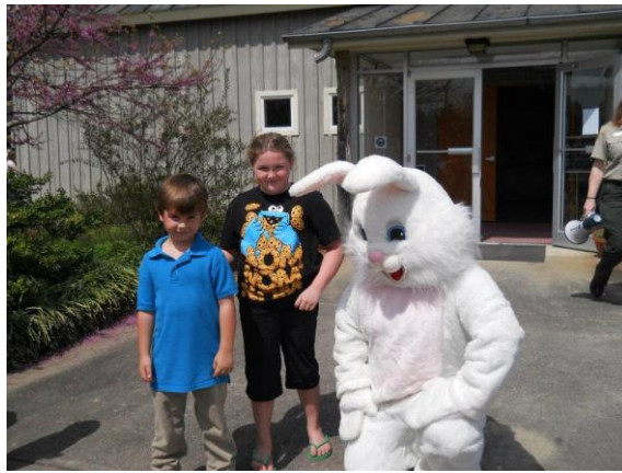
Figure 2: Children enjoy a visit with the Easter Bunny at the Park's Annual Easter Egg Hunt.