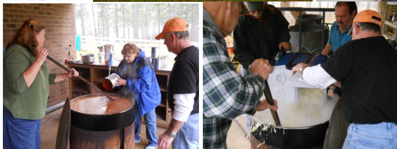
Figure 8: Members of the Foundation work together to prepare a delicious stew. Proceeds went to fulfill the mission of the Foundation.