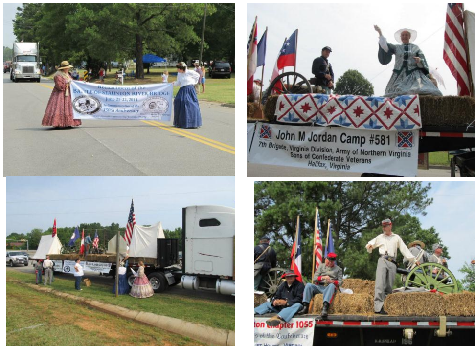
Figure 5: The Foundation participated in the 4 th of July Parade in the Town of Scottsburg. More than 20 individuals participated on the float or marched alongside the banner announcing the 2014 Reenactment.