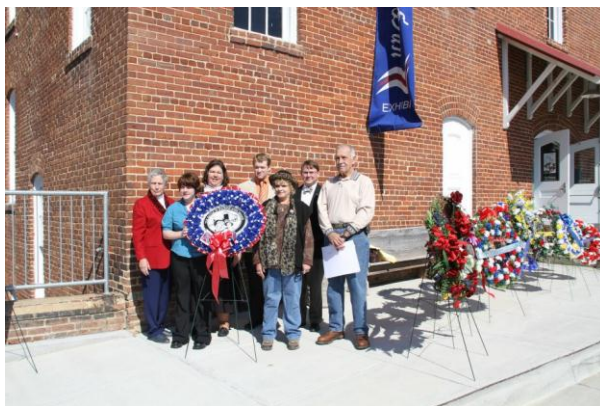
Figure 1: Trustees present the Foundation's memorial wreath in honor and in memory of the American Patriots who fought during the Crossing of the Dan in 1781.

Crossing of the Dan – Saturday, Feb. 18, The Foundation along with 25 other hereditary, social, and civic organizations paid tribute, by laying and presenting a wreath, in memory of the American Patriots who fought during the decisive American Revolution event known as the Crossing of the Dan in South Boston.